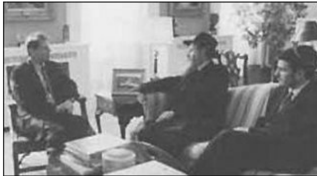
(Former Vice-President) Senator Al Gore